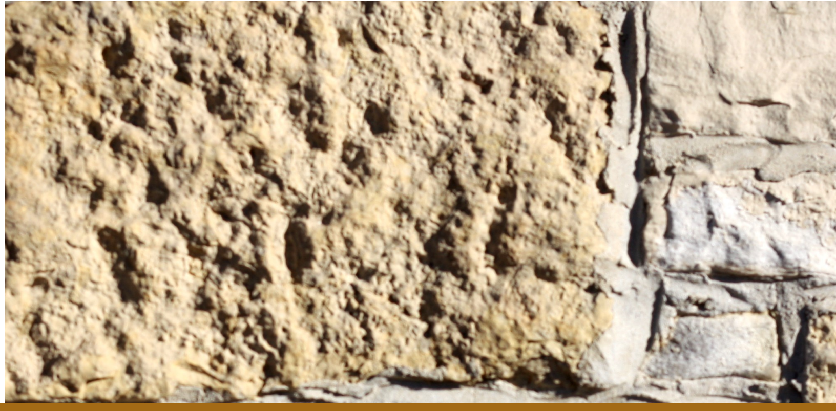
2021 ANNUAL REPORTS COMMITTEE REPORTS