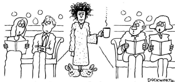
Mrs. Jones got a little too used to watching online worship from home.

This year World Laughter Day was last Sunday, May 3. Let's enjoy the cartoon below ... albeit it be a few days late, a good chuckle is good any day!