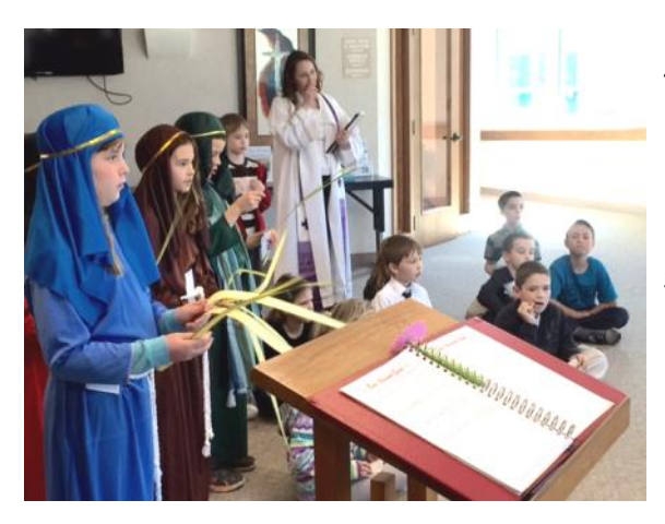
4th & 5th Grade Sunday School Class on Palm Sunday Parade:

Portraying Jesus and Disciples at the Garden.