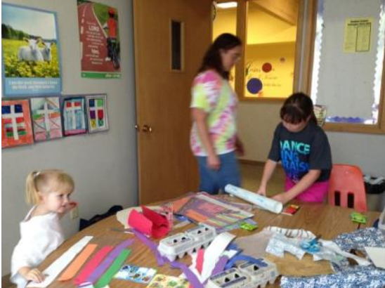
At left: Kids on a Mission At right: Letter writing to men & women serving overseas in our military. Below: Waukesha Food Pantry food collection