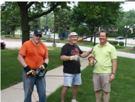
At right & left: Calvary property clean-up