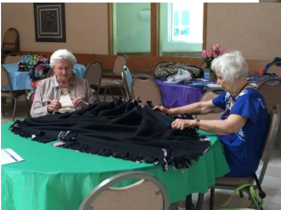
At left: Fleece blanket making for LWR At right: Random Acts of Christian Kindness Above: Collections for SVdP and LWR health & school kits.