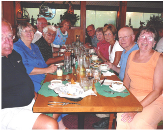
Small groups can form based on similar ages, interests, demographics, or merely time availability of its members.

Each small group usually has between 6 and 12 people and may or may not be led by a small group leader. The groups may be organized around location, stage of life, marital status, special interests, and other needs. You can choose the group that you want to be part of based on your own interests, availability, and affinity with the other people