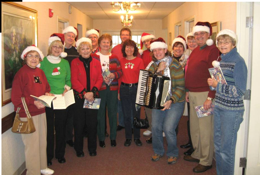
A photo of Christmas Caroling 2009! Join us this year!

You may have noticed this latest addition to Calvary, located by my office. This new pop machine hums pretty loud. I think it may be auditioning for the choir.