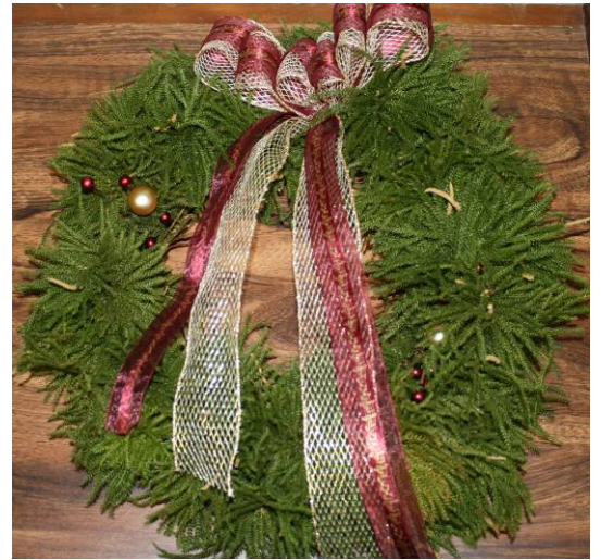
It's I spy time. This wreath is prominently displayed in our Sanctuary this Advent. Can you spot where?