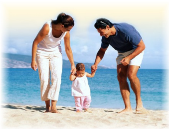
Calvary Missions Endowment

The tradition of giving and caring encouraged by Martin Luther continues today through the Calvary Mission Endowment Fund. The fund was established by a special resolution of the congregation in 1996 to provide a lasting vehicle for people to express special gratitude to God for the blessings they have received through their church.