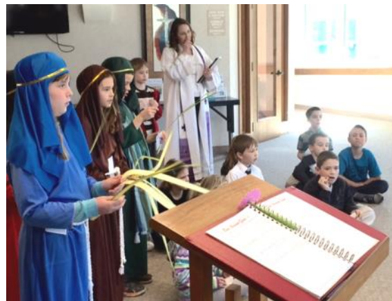
4th & 5th Grade Sunday School Class on Palm Sunday Parade:

Portraying Jesus and Disciples at the Garden.