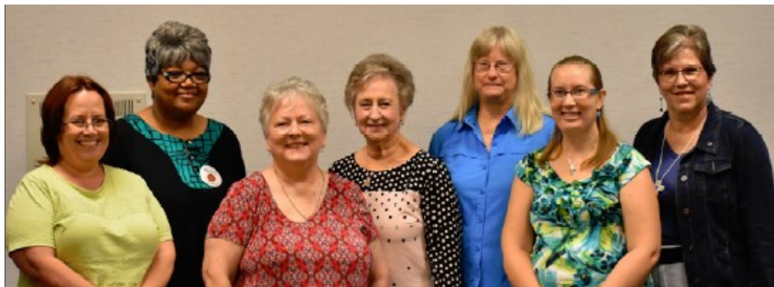
2017-2018 Women's Council of the NALC

https://www.samaritanspurse.org/what-we-do/operation-christmas-child/