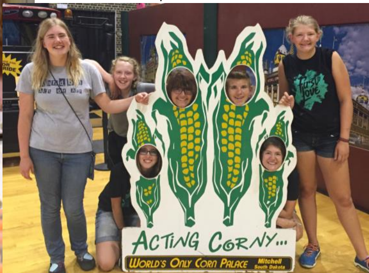
↓ Youth Mission Trip