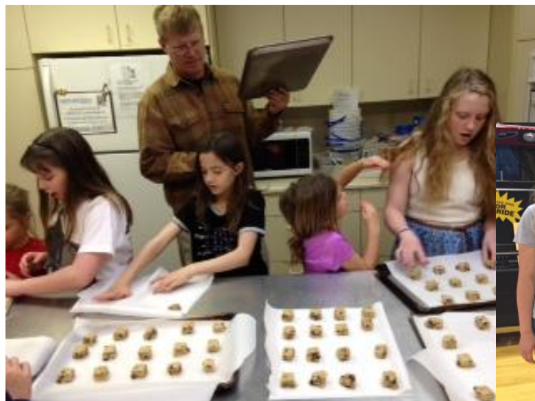
Firm Bake-o-Rama Event